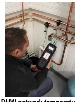
DHW network temperature