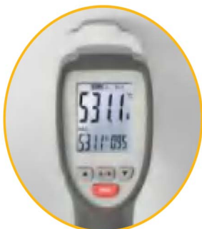
Triple LCD display with white backlit