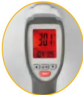
Red backlight alert