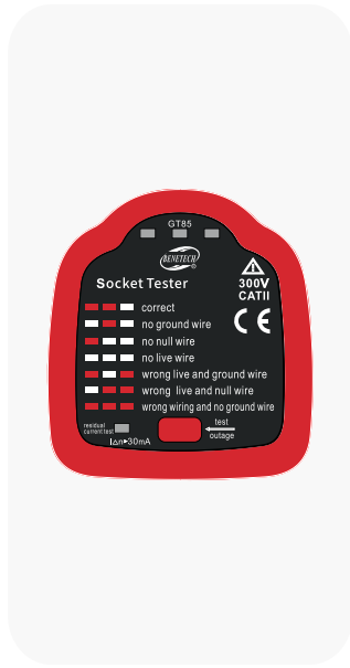
Version : GT85-EN-00