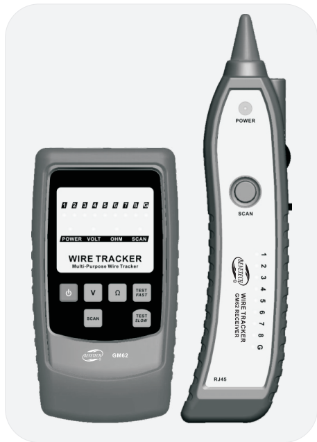
Version : GM62-EN-02