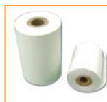
SPARE THERMO PAPER P/N: VM69811B SIZE: 38MM X 20M X 30@