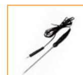
EXTERNAL TEMP. PROBE P/N: VZ981PAZ Color: black Size: 15cm probe w/handle 3.8mm diameter probe Cable: 116cm w/2.5mm jack