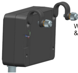
Wall mount hanger & nylon screw x 2

Wall mount hook to fix monitor and pH probe to water tank