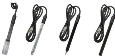
Low ionic 86P4